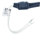
ET-NF RC Snubber Noise Filter 24-277 VAC for Electronic Controls