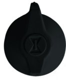
146MT579 Knob-Wall Switch FF Series - Black