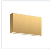
AT67010-BG-UNV Brushed Gold