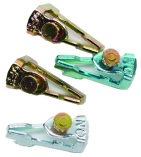
156T1978A Extra/replacement trippers 1 ON and 1 OFF