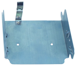
22T338GR Mounting Bracket for Intermatic Standardized Timer Mechanisms