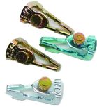
156T1978A Extra/replacement trippers 1 ON and 1 OFF