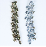
156T2548A 7 Sets of ON/OFF Trippers for T7400 and T7800 Series