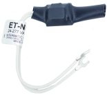
ET-NF RC Snubber Noise Filter 24-277VAC/DC for Electronic Controls