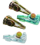
156T1978A Extra/replacement trippers 1 ON and 1 OFF