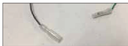
Current Selector Open = (360mA)