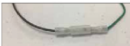
Current Selector Close = (300mA)