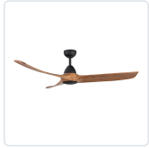
CF77860-MB/NW Matte Black/Natural Oak Wood