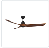
CF77860-MB/DW Matte Black/Dark Walnut