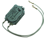
WG1573-10DMX 208-277 VAC, 60 Hz Motor for T102, T104, T106, T172, T174, WH40