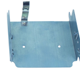
22T338GR Mounting Bracket for Intermatic Standardized Timer Mechanisms