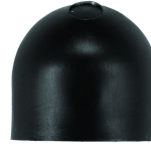
6LV1352 Light Shield Accessory for EK4036S, EK4436SM, K4000 Series Button Photocontrols