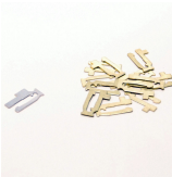
156T1950A Set of 12 Trippers for T1900, T2000, C8800, R8800 and T8800 Series 156T1950AD12 12 Bags of 156T1950A Trippers for T1900, T2000, C8800, R8800, and T8800 Series