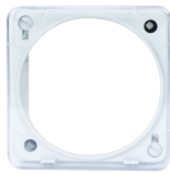
FM-FU FM1 Flush Mount Housing Kit