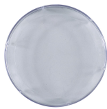
DC-FME-A Clear Dust Cover for Electronic Panel Mount Timers