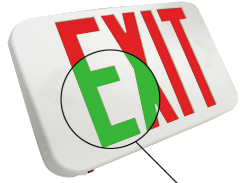
Field-switchable red and green legends

Model: _____ Date: _____ Accessories: _____ Job Name: _____ Type: _____