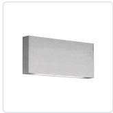
AT6610-BN Brushed Nickel