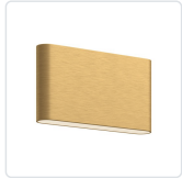
AT68010-BG-UNV Brushed Gold