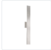
AT7935-BN Brushed Nickel