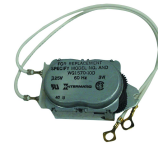
WG1570-10DMX 125 VAC, 60 Hz Motor for T101, T103, T105