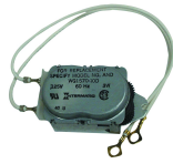
WG1570-10D 125 VAC, 60 Hz Motor for T101, T103, T105