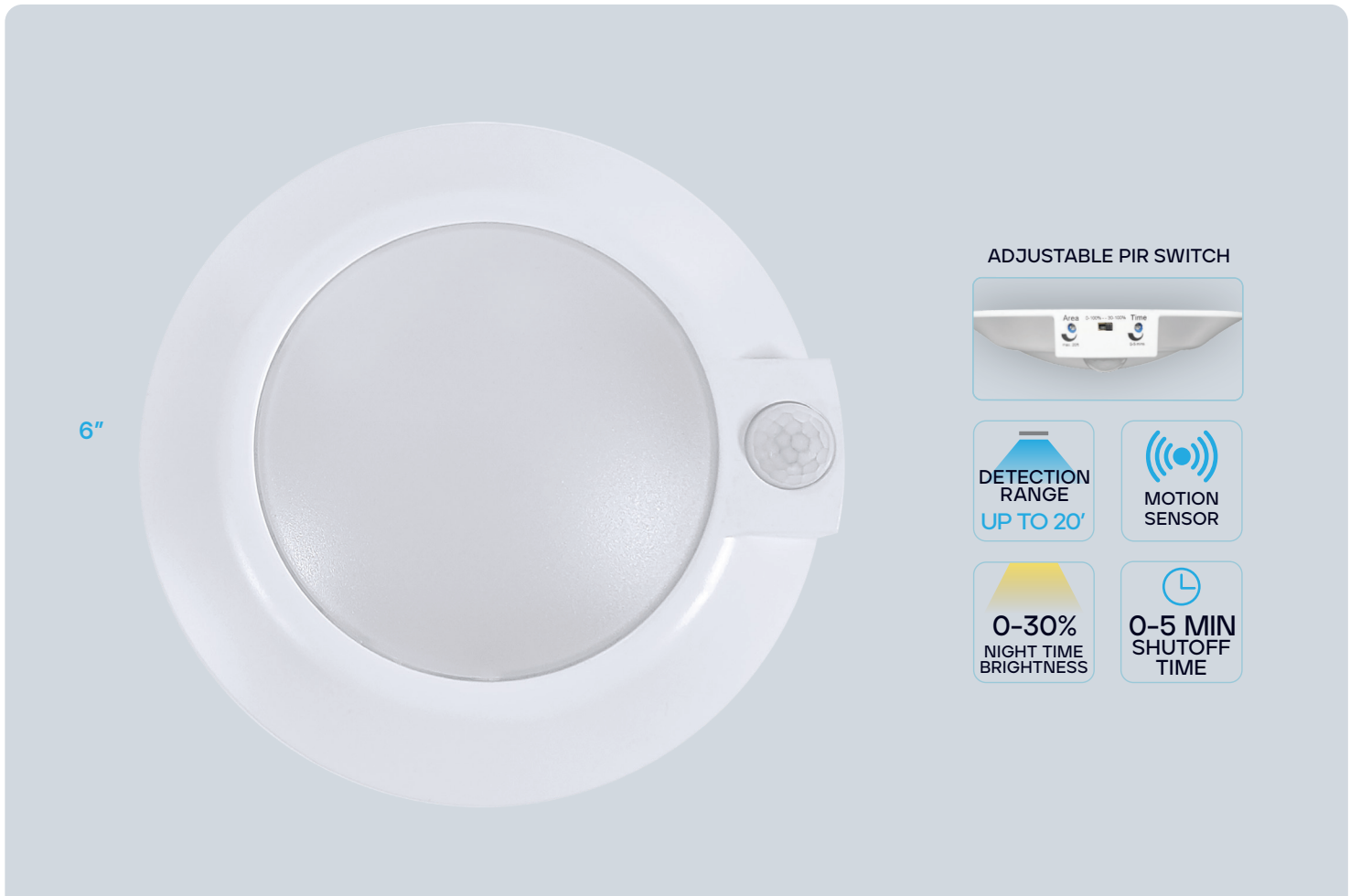
ADJUSTABLE PIR SWITCH