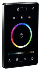
DMX Wall Control RGBW 4 Zone Wall Controller