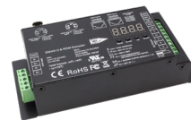
DMX Decoder (Required per zone)