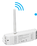
Wireless DMX Transceiver CTRL-WDMX-TRNRGV-X