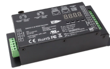
DMX Decoder (Required per zone)