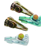
156T1978AMX 1 Set of ON/OFF Trippers for T100, T7000, and WH40