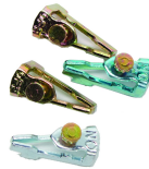
156T1978AD12 12 Pack of 156T1978A Trippers for T100, T7000, and WH40