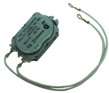
WG1573-10DMX 208-277 VAC, 60 Hz Motor for T102, T104, T106, T172, T174, WH40