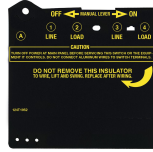
124T1952 Insulator for Double-Pole Time Switch (T103, T104, T105, T173, T174, T175, T176, T185, WH40)