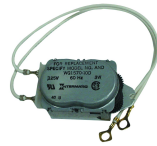
WG1570-10D 125 VAC, 60 Hz Motor for T101, T103, T105