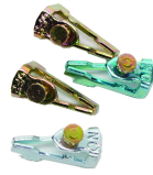
156T1978A Extra/replacement trippers 1 ON and 1 OFF