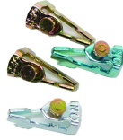
156T1978A Extra/replacement trippers 1 ON and 1 OFF