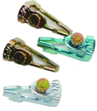
156T1978AMX 1 Set of ON/OFF Trippers for T100, T7000, and WH40