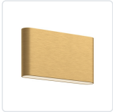
AT68010-BG Brushed Gold