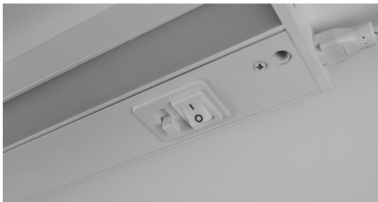
Standard three selectable CCT 3000K, 3500K, 4000K