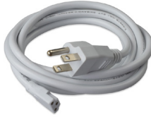
Plug-In Power Feed