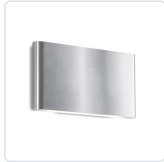
AT68010-BN Brushed Nickel