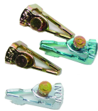
156T1978AMX 1 Set of ON/OFF Trippers for T100, T7000, and WH40