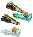
156T1978A Extra/replacement trippers 1 ON and 1 OFF