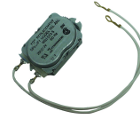
WG1573-10DMX 208-277 VAC, 60 Hz Motor for T102, T104, T106, T172, T174, WH40